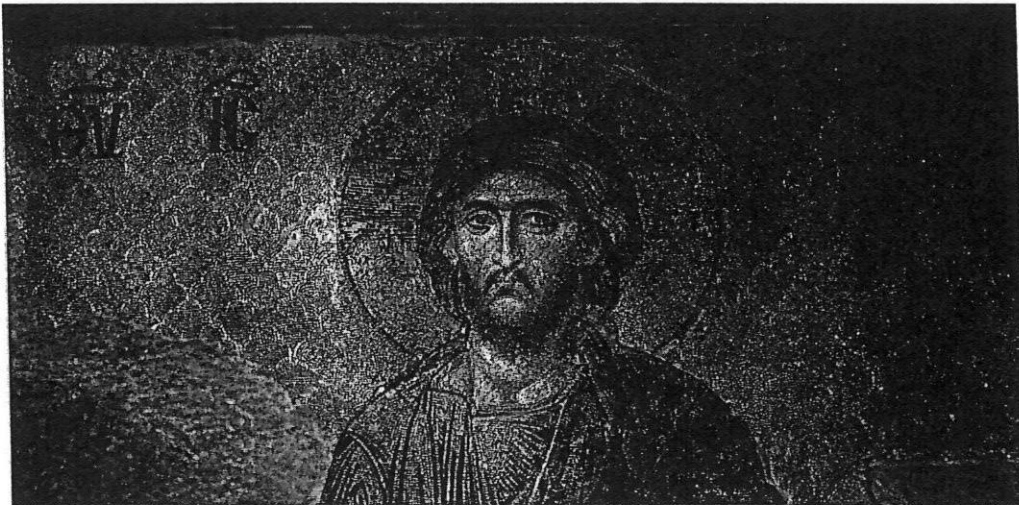
Christ Pantocrator, Deesis Mosaic, 13th Century