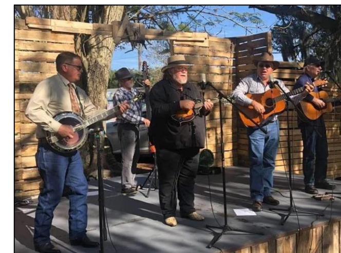
Swinging Bridge Bluegrass Band

Receiving the Light, Being the Light, Sharing the Light of Jesus Christ